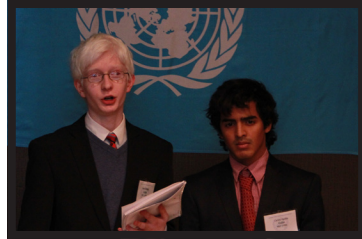
Cuba addressed the press.

is merely a precautionary measure and that they are not actively seek-