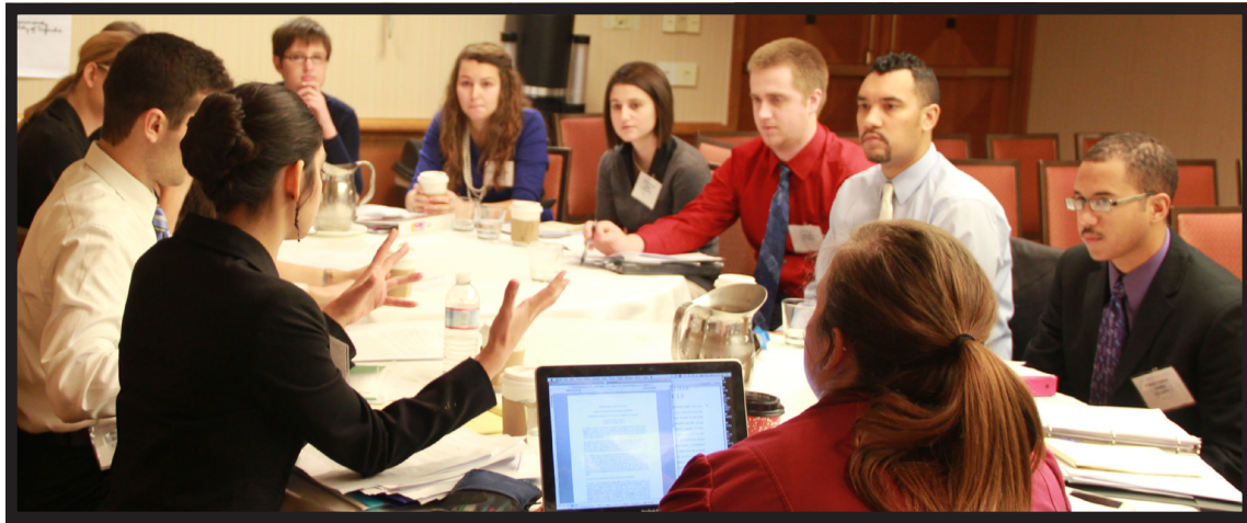
The 15 Justices of the International Court of Justice deliberate behind closed doors, debating over the occupation of the Democratic Republic of the Congo by Uganda.

"I really want to take the time this week to unite North and South Korea. High priority for China."