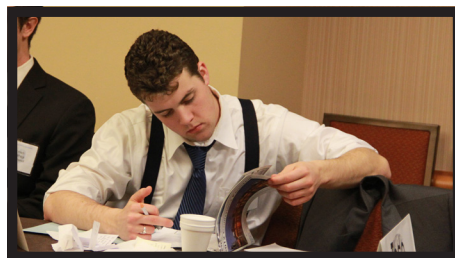
Security Council The Security Council remains focused on escalating crises.