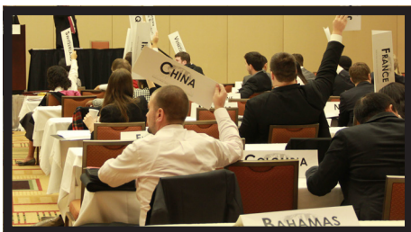
GA Second Committee GA2 votes on draft resolutions early on Monday morning.