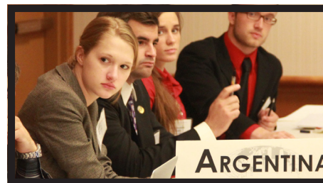
HSC 1948 Focused and alert the members of the HSC 48 are hard at work.