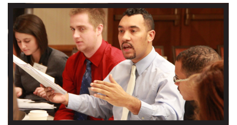
ICJ Debate gets intense in deliberations in the International Court of Justice.